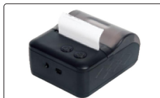
bluetooth printer (included in 9646-301)