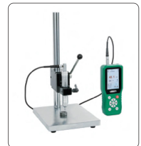
stand (optional), suitable for measuring small workpieces, fast and stable