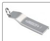
software flash disk (included)